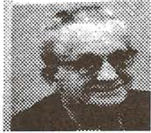
Harry Colnett Fund

As all members know the Harry Colnett Scholarship Program was established many years ago to encourage able and interested students to prepare for service in areas of food production and related research in developing countries.